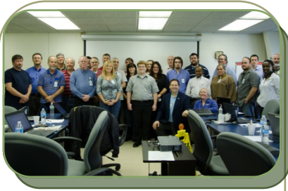
Argos Training Class Participants