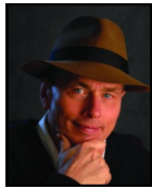
From the Director...