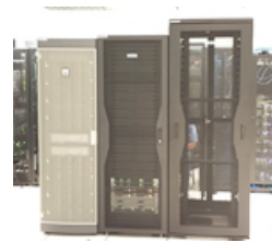
Safe and Sound