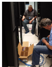
Setting up in Charleston

Thanks to this project, either site could be completely destroyed without data loss. Eventually we will implement Site Recovery Management, which provides automated fail over to the redundant site if a computer system becomes inaccessible. WVNET services will be protected from disaster by this new Disaster Recovery setup. This will also benefit our customers who can establish disaster recovery capability with either of the sites.